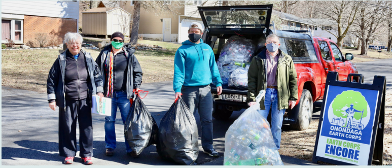
Volunteers organize and host a bottle bonanza fundraiser by distributing flyers and collecting bottles in Fayetteville, NY.