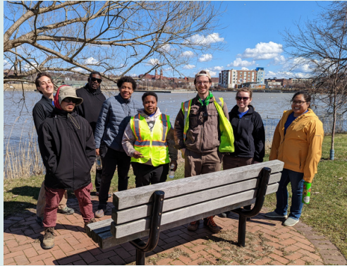
OEC Staff pause by the inner harbor for a photo on a sunny day during staff training.

At Onondaga Earth Corps (OEC), winters are always a time to reflect, recharge, and then reemerge in spring with energy to propel the youth and young adults in our program forward. 2022 is no exception and our team has been very busy. Since the beginning of the year, our field staff and participants have pruned trees (in the snow!) and hosted stewardship events; our administrative team visited conservation corps programs in Philadelphia and hired an amazing slate of staff members; and, for the first time in our history, OEC started running a youth program in what is typically the “off season”. After two very intense years of continual adaptation and triage, our reemergence in 2022 is very uplifting.