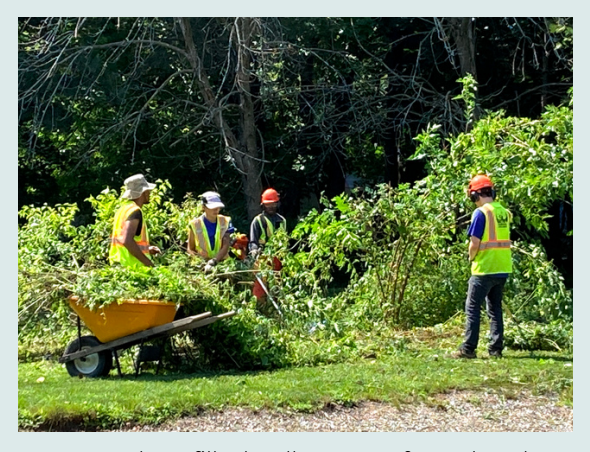
Crewmembers fill wheelbarrows of weeds to be discarded.

OEC teamed up with City Parks for a clean up project on the Near Westside, at Ward Bakery Park and Orchard (231-33 Shonnard St. Syracuse, NY 13204). The objective was to provide an open view into the park from the street side and to simply beautify this underutilized park. We were able to prune 41 trees and cleaned up an overgrown rain garden, saving a dogwood and a mulberry tree from continuing to be overgrown bindweed. We would love to see residents utilize Ward Bakery more for fun family activities, especially with the orchard that consists of apple and peach trees. Thank you to City Parks, Volunteers, our AmeriCorps and Kirk Park Youth members for putting in your hard work!