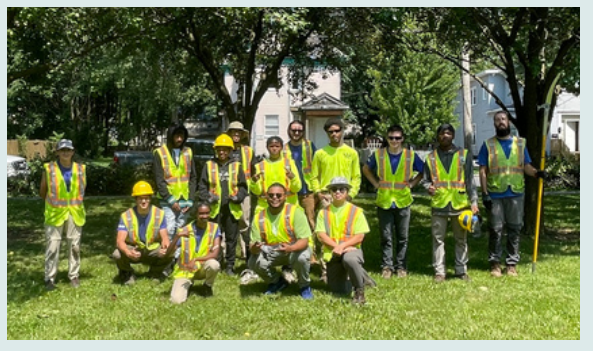
Group photo of the crew that helped to clean up Ward Bakery at the start of the event.