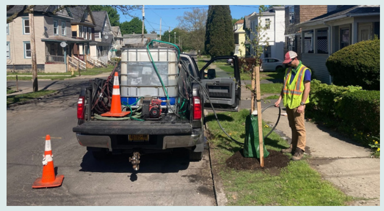
Garrett Boland waters a newly planted street tree. OEC maintains newly planted trees through a variety of maintenance activities with watering being critical through the summer.

We plant a lot of trees here at OEC and those trees need some help during periods of drought. This added stress can impact a tree in a web of different ways. Death of that tree is a real concern and can be mitigated by proper watering techniques. Other ailments are possible and those might not be as immediately noticeable as the death of the tree. Insects and pathogens typically attack a tree stressed by drought. A tree's water balance might come out of line and lead to an early or less brilliant autumn color. During intense dry periods, trees may struggle to gather water and nutrients over nearby grasses. Many of these ailments can have long term consequences that are negative for a city's urban forest.