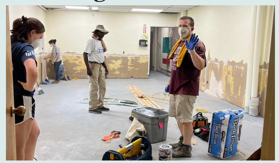
Volunteers and OEC Staff prepare a rooms at 490 W. Onondaga St. by removing carpet off the wall, and get the walls ready to be painted.

For several years, the Onondaga Earth Corps has had an office inside of the SUNY Educational Opportunity Center (SUNY EOC) at 100 New St. in Syracuse, but as the years have gone by, we have outgrown our space. Over the course of the next few weeks, we will be packing boxes and moving items to our new office at 490 W. Onondaga St., Syracuse, NY.