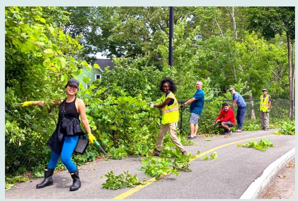
Volunteers at the United Way Day of Caring event, work to clean up the creekwalk by clearing the fenceline of invasive and overgrown plants.

We started the day with introductions and project overviews as well as expressing our appreciation for help with the hard work ahead. We then held a stretch circle where multiple people had an opportunity to step outside of their comfort zone and lead stretches for the large group. We broke up into small groups and got started on the creekwalk makeover and Jubilee Homes maintenance.