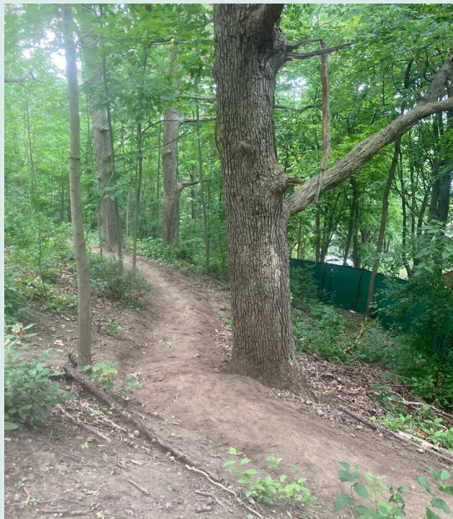
OEC crews create a sustainable trail by building a half bench trail tread. This helps prevent further erosion and promotes better runoff for water along the slope. Before- Left, After- Right.

"My time at OEC was a great experience how I found out about the company was by a fellow crew member. Under previous circumstances I felt I wasn't ready, but OEC helped me with being independent and dependable. This is my second season here and I hope to have a long journey with this organization. My favorite Green Infrastructure sites are at Water St., Leavenworth Park, and East Washington St.. My favorite weeds to pick are milkweed, wild garlic, and golden rod. Working at these sites challenged me. I was put in many learning situations and I grew from them. I thank OEC for their program and for giving me a chance to succeed and better myself."