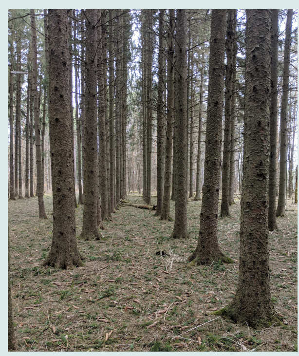
Row of Spruce Trees at Highland Forest