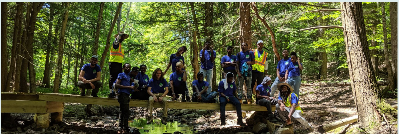
The crew explores the woods during summer orientation at the 4H Environmental Education Center in Amboy, NY

November 9, 2019 from 6pm-9pm Save the Date Syracuse, NY Hosted by OEC Volunteers Annual OEC Fundraising Event