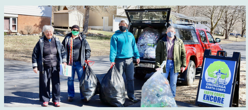
Volunteers organize and host a bottle bonanza fundraiser by distributing flyers and collecting bottles in Fayetteville, NY.