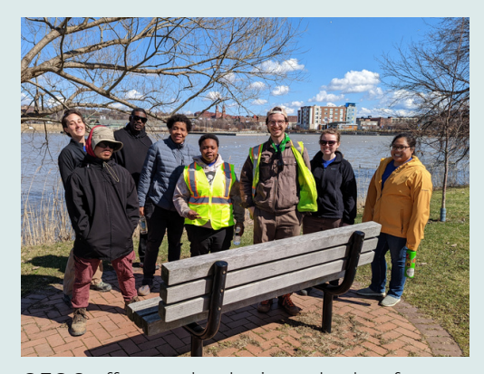
OEC Staff pause by the inner harbor for a photo on a sunny day during staff training.

At Onondaga Earth Corps (OEC), winters are always a time to reflect, recharge, and then reemerge in spring with energy to propel the youth and young adults in our program forward. 2022 is no exception and our team has been very busy. Since the beginning of the year, our field staff and participants have pruned trees (in the snow!) and hosted stewardship events; our administrative team visited conservation corps programs in Philadelphia and hired an amazing slate of staff members; and, for the first time in our history, OEC started running a youth program in what is typically the "off season". After two very intense years of continual adaptation and triage, our reemergence in 2022 is very uplifting.